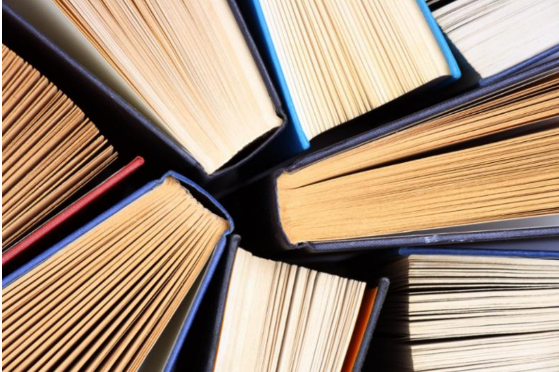
Old Hard -Covered Books