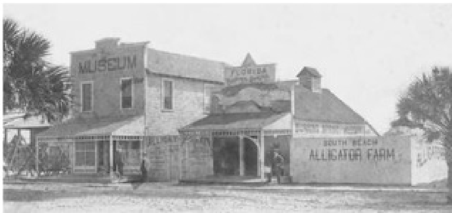
Vintage Images of the Alligator Farm