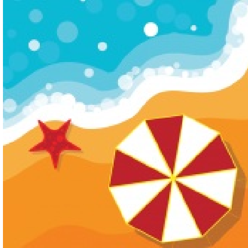
Reach the Beach Icon