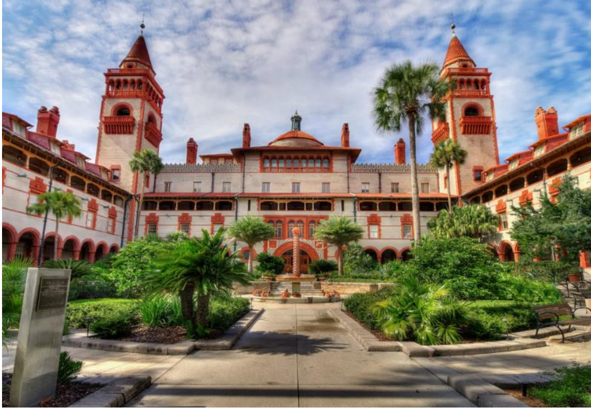
Flagler College Courtyard