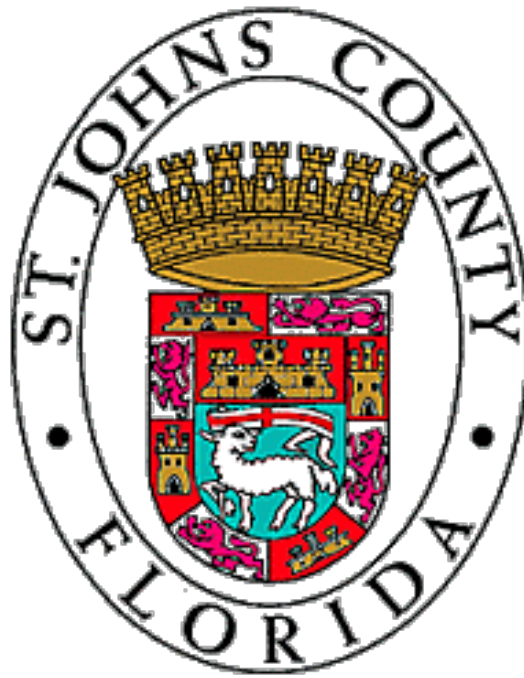
St. Johns County, Florida Seal

County Public Works staff will hold a public meeting regarding the St. Johns River-to-Sea (SJR2C) Loop multi-use trail on July 11th at 5:00PM to 7:00PM at the Guy Harvey Resort in St. Augustine Beach (860 A1A Beach Blvd, St. Augustine Beach, 32080.)