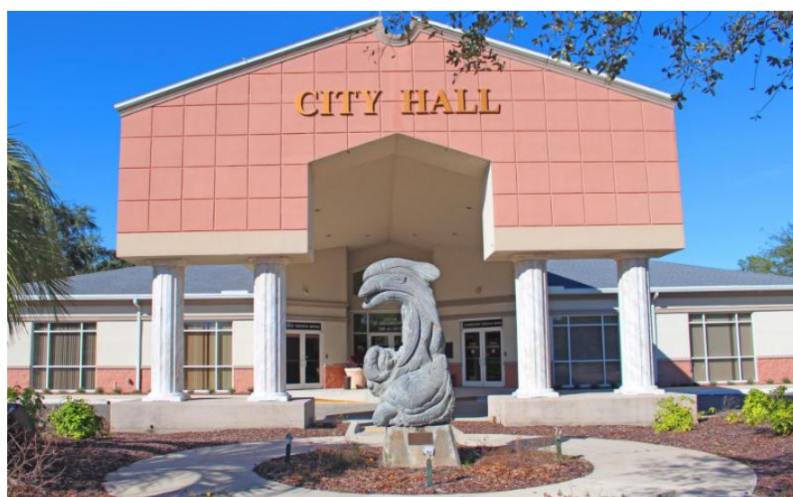
Entrance to St. Augustine Beach City Hall

St. Johns County is encouraging all residents to sign up for Alert St. Johns, a new emergency notification system that provides critical information during emergency situations. The Alert St. Johns system enables St. Johns County, the St. Johns County Sheriff's Office, the City of St. Augustine, and the City of St. Augustine Beach to quickly inform residents regarding a variety of situations, including severe weather, unexpected road closures, water advisories, missing persons, evacuations of buildings or neighborhoods, and incidents that may threaten public safety. Residents can sign up at www.sjcemergencymanagement.com . Those who sign up can choose to receive notifications via a phone call to their home, business, or mobile phone, by email, or text message. The Alert St. Johns system has replaced the Code Red notification system, so it is imperative that residents sign up for these critical notifications. For more information regarding Alert St. Johns, please call 904.824.5550.