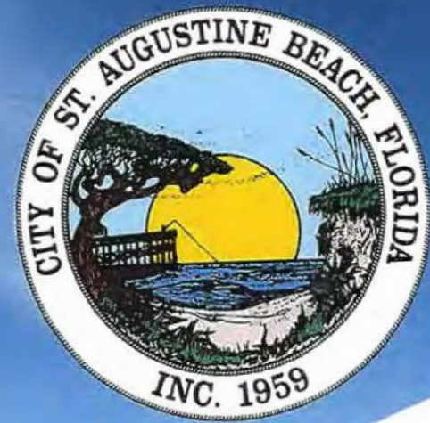
Exhibit A-1 Date 9-25-2023