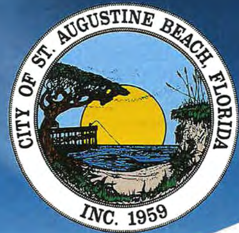
Exhibit A-1 Date 9-17-2023 Budget