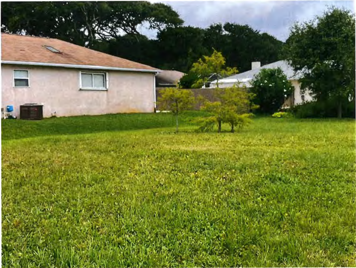
Exhibit A-4 Date 6-08-2023