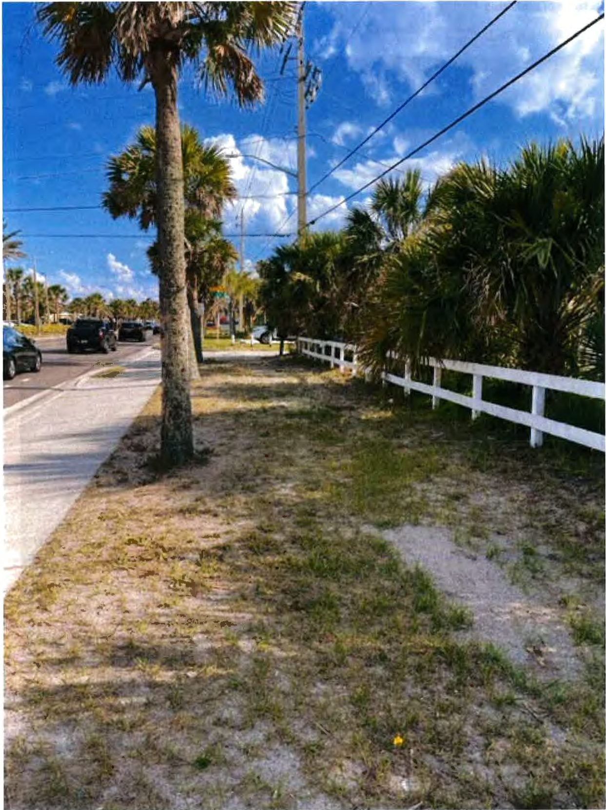
Exhibit A-2 Date 6-08-2023