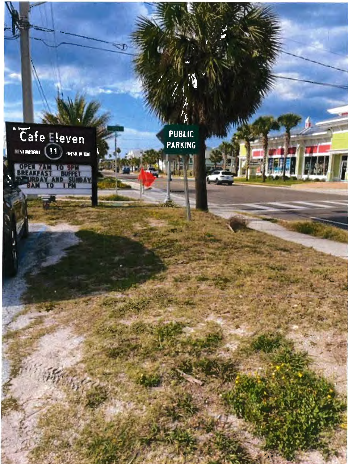
Exhibit A-1 Date 6-08-2023