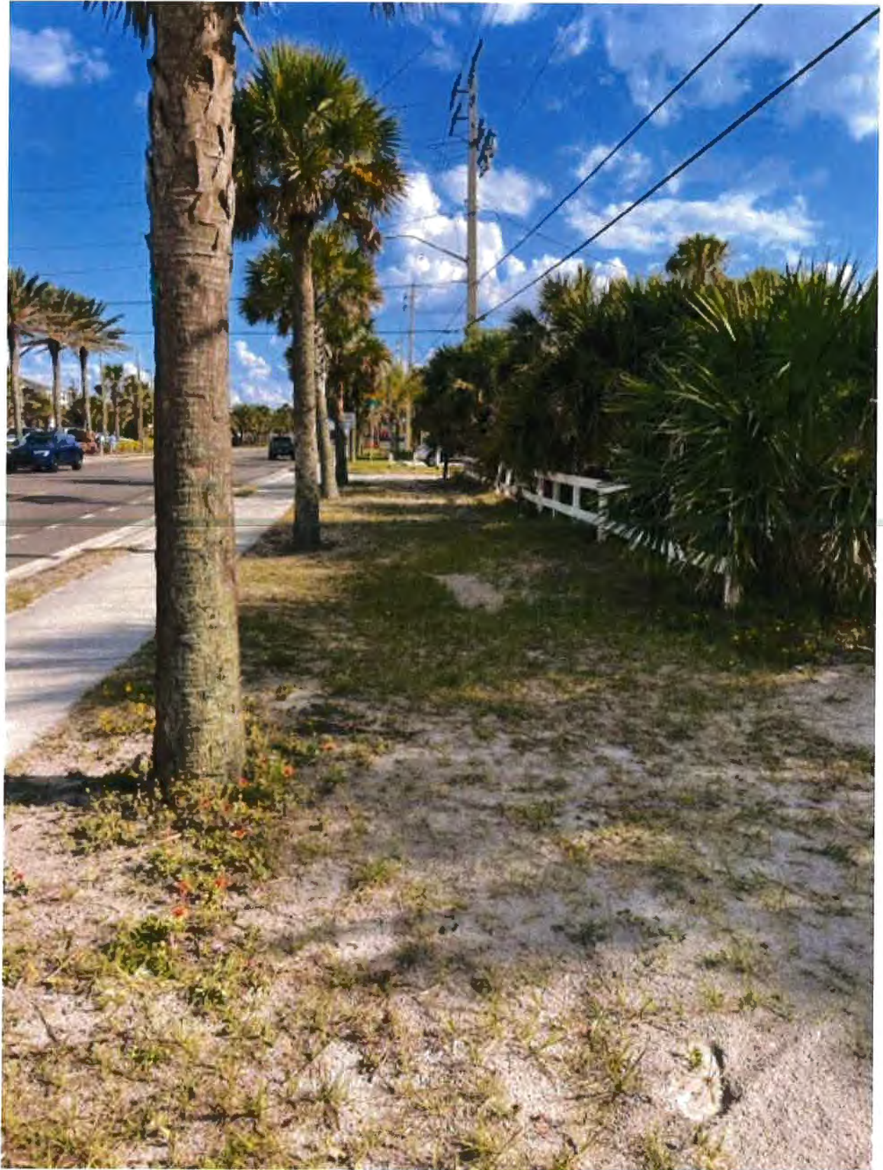
Exhibit A-3 Date 6-08-2023