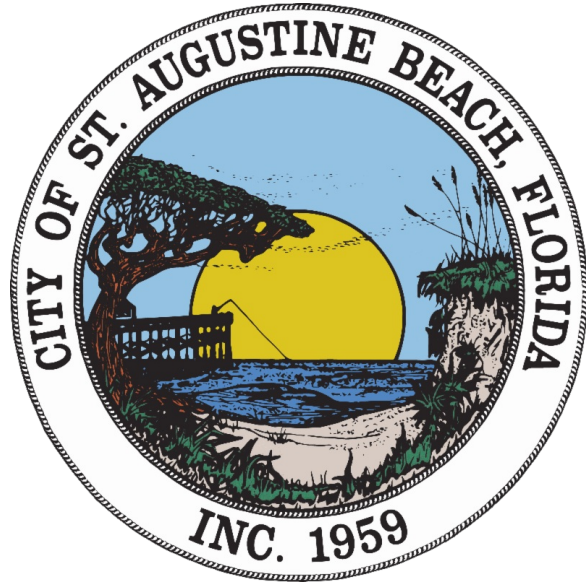
City of St. Augustine Beach Seal