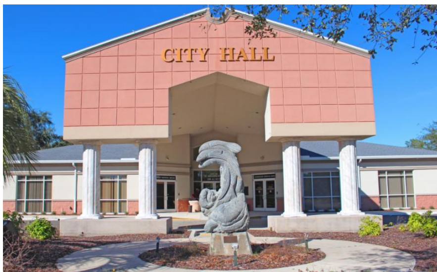
Entrance to St. Augustine Beach City Hall

Any further changes to the schedule will be posted on the City's website, Facebook, and on the City Hall doors.