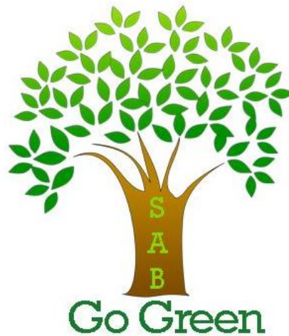
Go Green SAB logo

Questions can be emailed to braddatz@cityofsab.org and should be submitted no later than 3:00 p.m. on Monday, May 4, 2020.