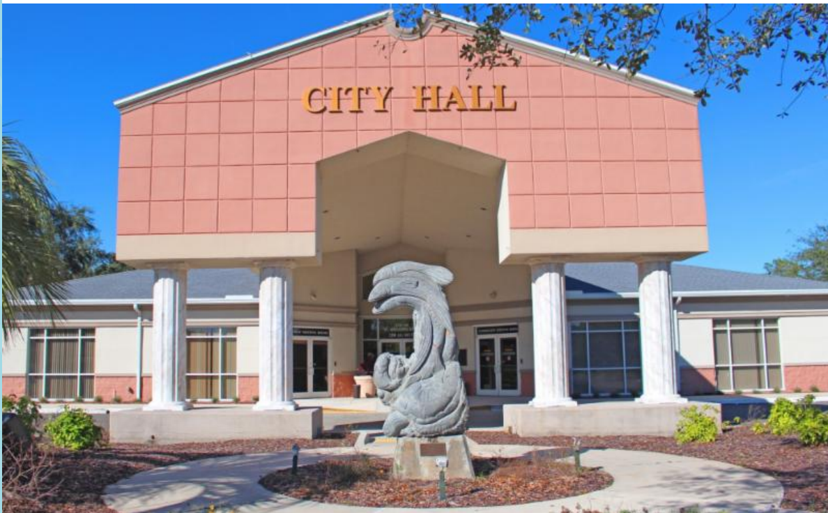
Entrance to St. Augustine Beach City Hall

The Anastasia Mosquito Control District now has an app that will make it much easier for St. Johns County residents to make service requests and receive important information, like fogging schedules and disease outbreak notifications. To download the free app search "MGIS" in the App Store or Google Play Store.