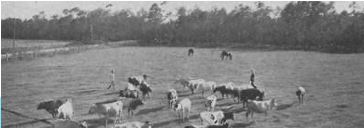
Vintage Photo of Cattle Ranch