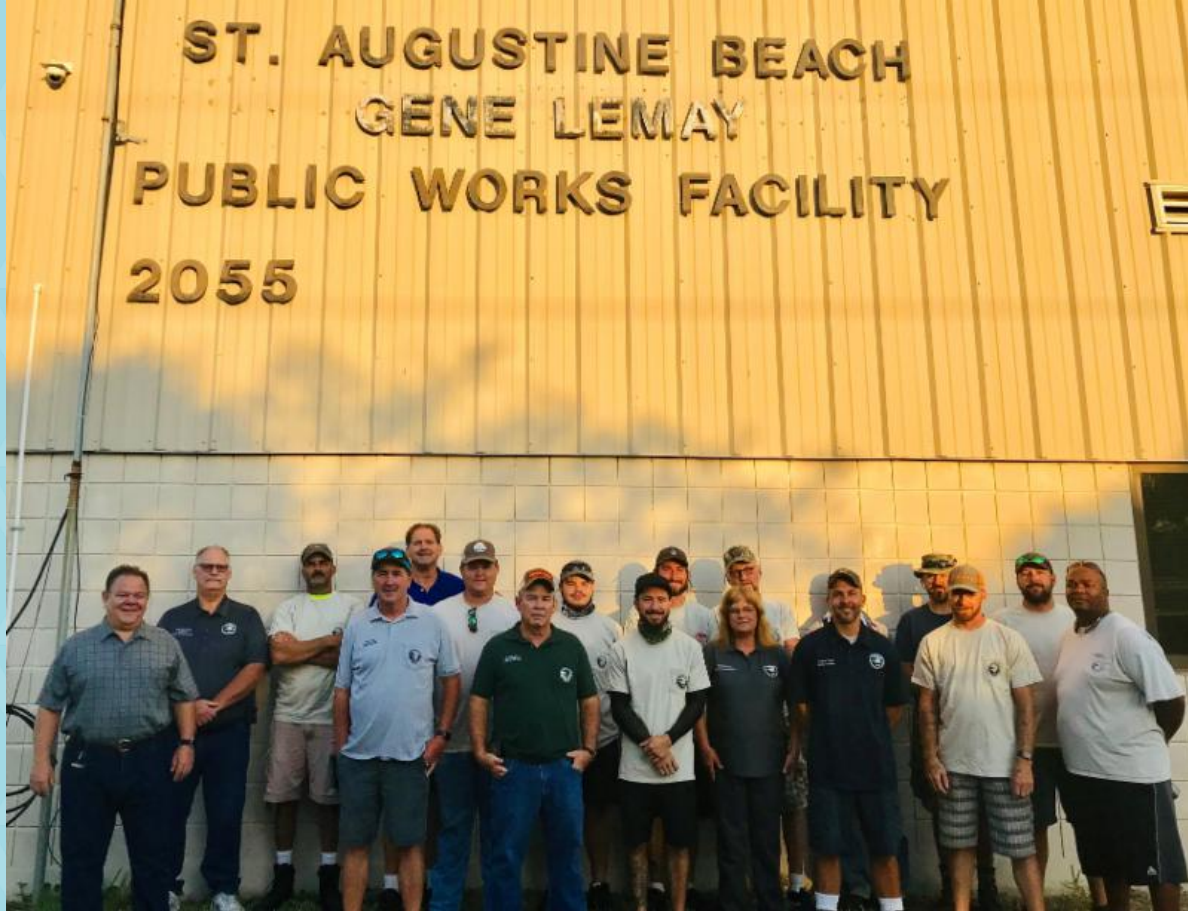
Public Works Department