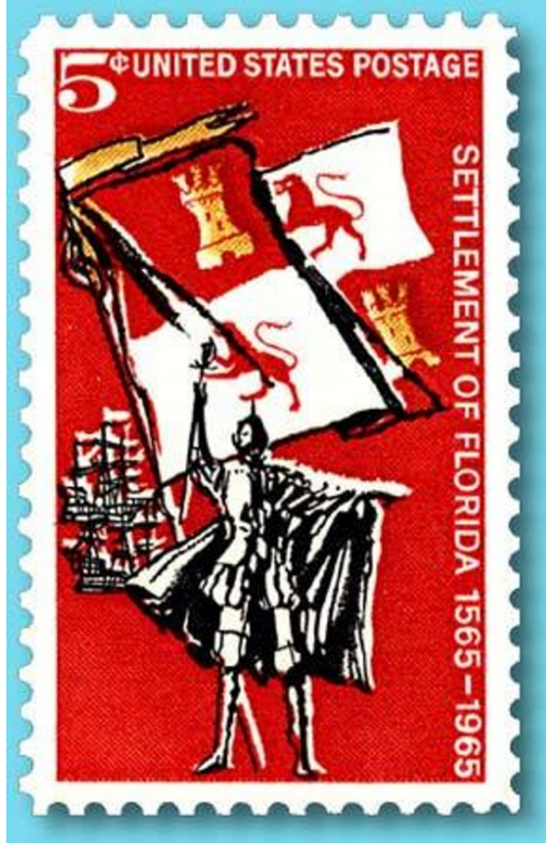
Settlement of Florida Stamp