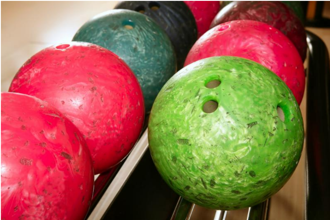
Anastasia Bowling Lanes