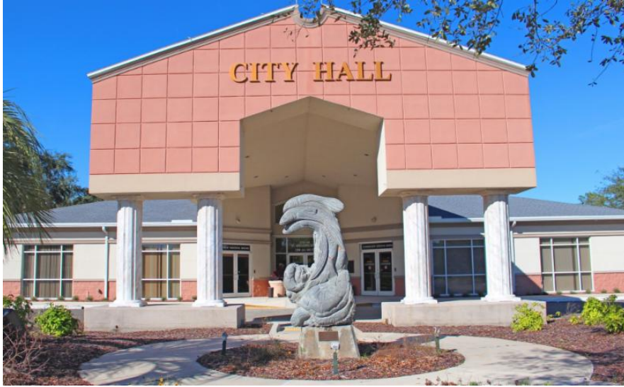
Entrance to St. Augustine Beach City Hall