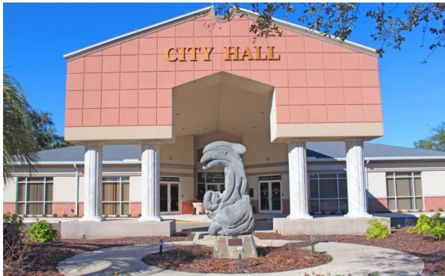
Entrance to St. Augustine Beach City Hall