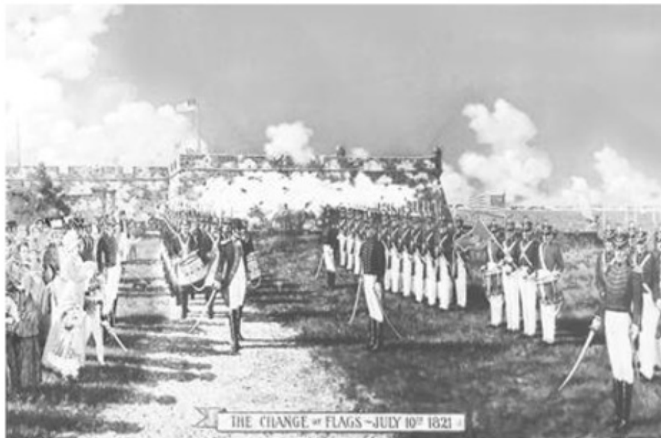
The Changing of the Flags - July 10, 1823