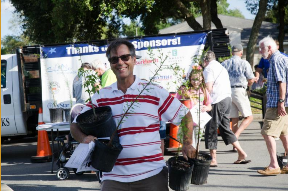
Man with tree at Arbor Day event