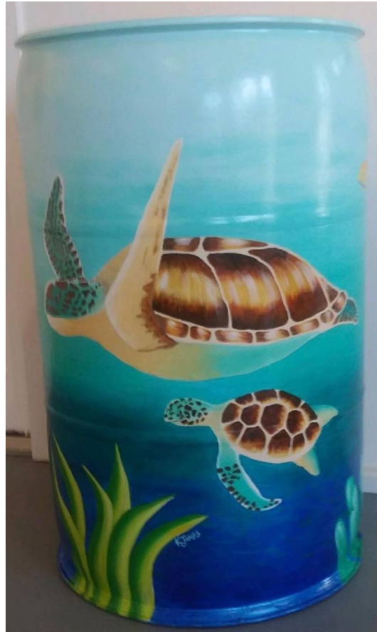
Turtle ART CAN!