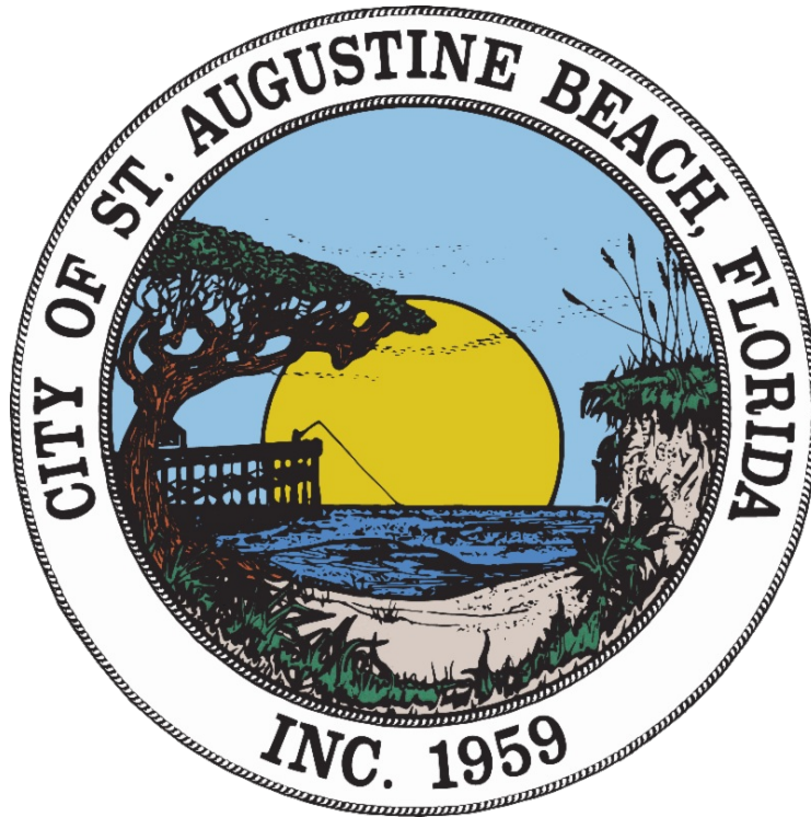
City of St. Augustine Beach Seal