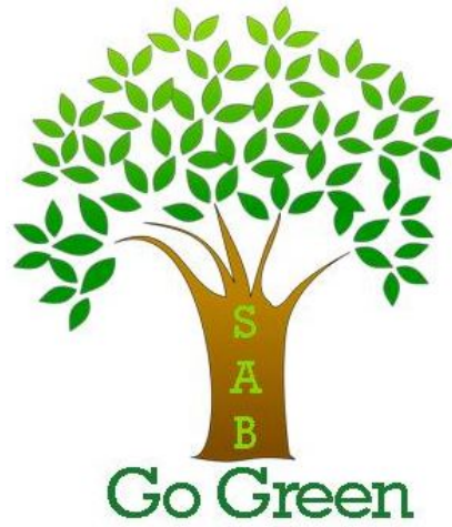
Go Green SAB logo